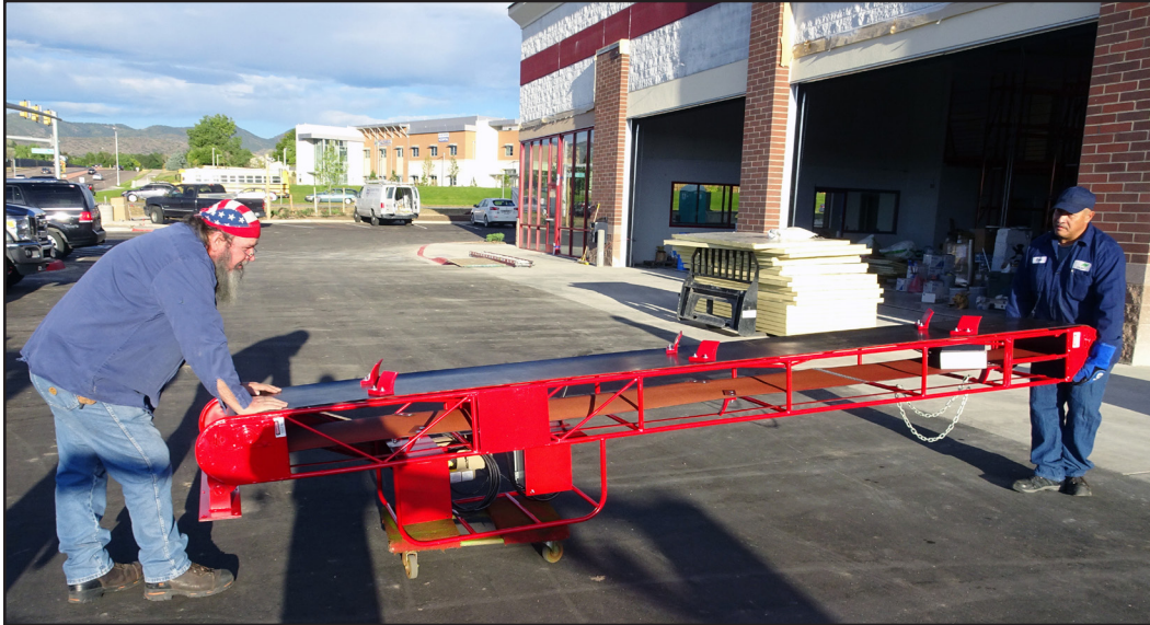
- A 4 wheel dolly is recommended for conveyor transport and positioning