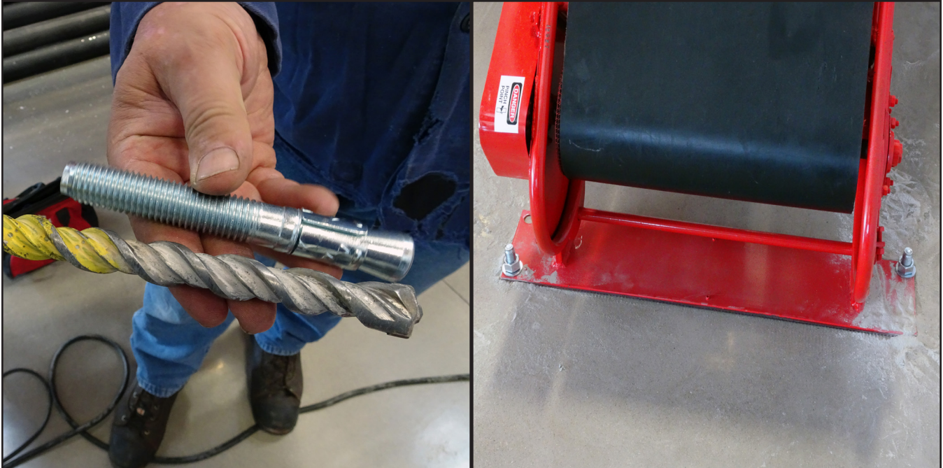
- Use a 1/2 inch hammer drill bit and anchors to bolt down two opposite ends of the conveyor base