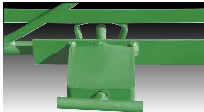
Spring tensioned T-handles for quick dolly attach/detach.

The E-Z LIFT Troughing-Roller Conveyor is a medium duty conveyor designed for loose and packaged materials at inclines up to 30 degrees. The conveyor's idler roller bed provides minimal resistance, long life, and is ideal for continuous duty applications and processes.