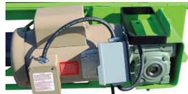
Direct drive unit